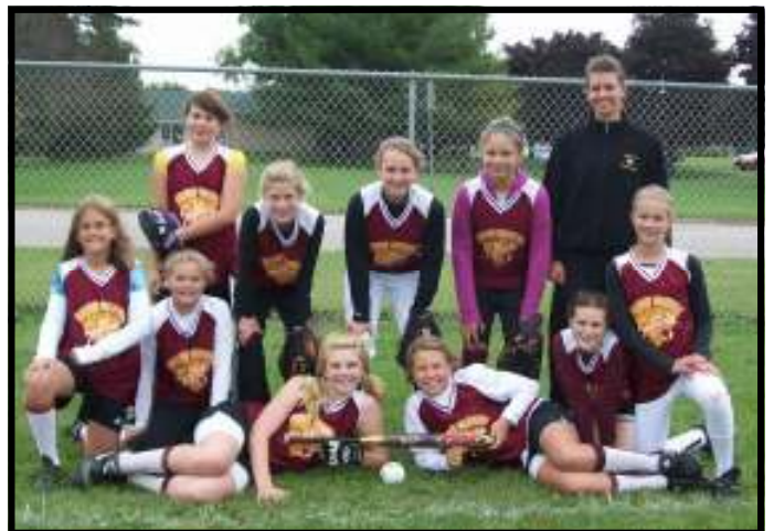
2009 FCS Girls Softball