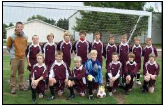
2009 FCS Boys Soccer