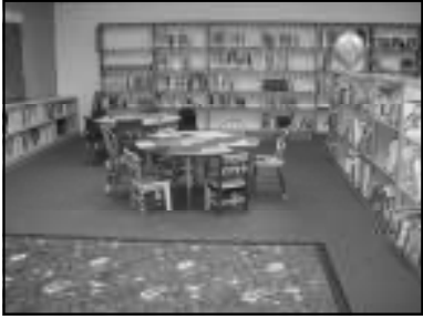
2nd—8th Grade Library