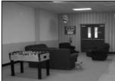
Falcons Nest! What a great addition to our middle school!